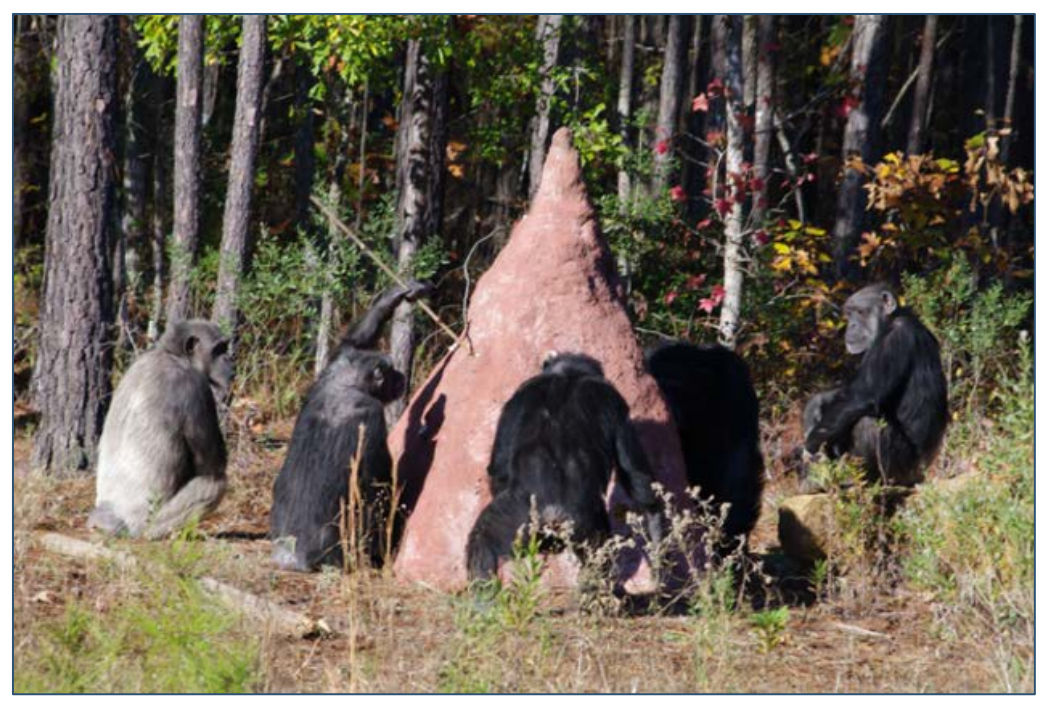
The partly government-funded Chimp Haven in the USA provides an enriching 'retirement' for primates that were used in government testing facilities.

In November last year, it was reported<sup>29</sup> that the chimpanzees still used by the United States' National Institutes of Health for animal testing would soon be sent to sanctuaries for their "retirement" as the US governmental medical research agency ceases its chimp program altogether. Upon retirement, the chimps will be sent to Chimp Haven – a partly government-funded facility in Louisiana that currently houses more than 200 chimps. There are also a number of other independently operated facilities for research animal rehoming in the US and Canada.