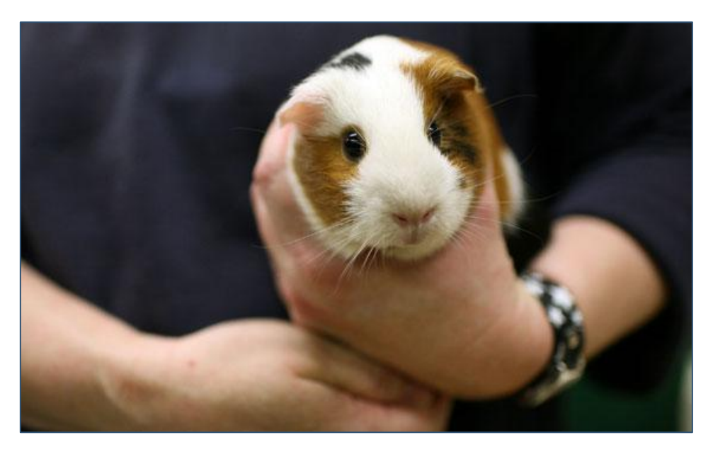
Many guinea pigs used for scientific purposes would be suitable for rehoming in Australia every year.

What the latest figures (2013-14) from NSW indicate is that there were large numbers of farm animals such as poultry, pigs, sheep and cattle being used for research purposes in NSW in a variety of procedures. Aside from the largest groups - rats, mice, amphibians and aquatic species - there were a number of animals that may be suitable for rehoming as shown in Figure 1. These included captive native and exotic birds (1,210), cats (179), dogs (1,760), ferrets (34), goats (919), guinea pigs (749), horses (691), primates (22) and rabbits (1,633)<sup>6</sup>. There were also 4,262 native mammals, 5,029 reptiles and 72 exotic zoo animals, some of which could possibly be rehomed at existing sanctuaries.