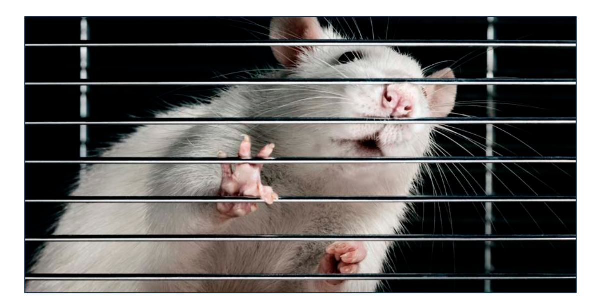
It can be difficult to obtain information from research institutions in Australia in regard to their use of animals.

While a Liberty movement does not engage in the debate on the ethics of animal-based research itself, the involvement of research institutions will require them, to some extent, to re-evaluate practices around public and stakeholder engagement.